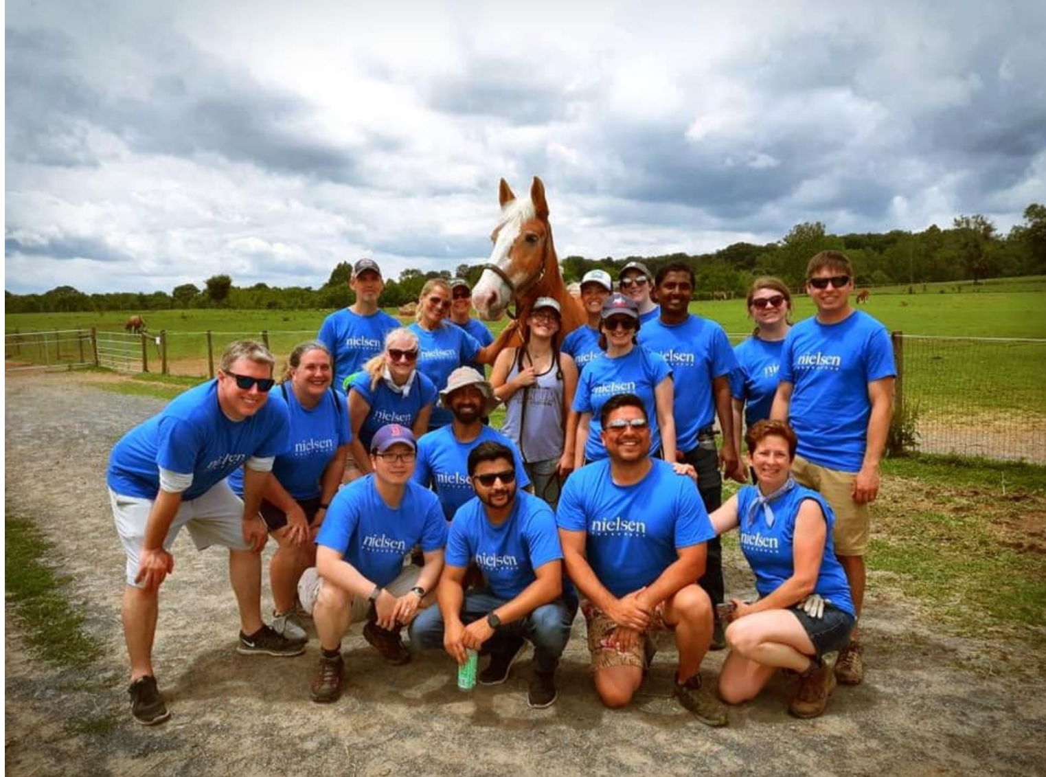
Volunteers are an integral part of the team at Days End Farm Horse Rescue!

Our volunteers provide over 55,000 hours of service each year helping to rescue and rehabilitate horses, educating the community about equine abuse and neglect, and raising funds to provide for future horses in need. We are always in need of individuals who are dedicated and dependable to lend us a helping hand. In fact, we offer a wide variety of opportunities, allowing people of all ages, abilities, and experience levels to help be a part of DEFHR's all-important volunteer base.